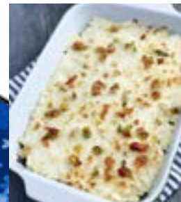
PIZZA COTTAGE PIE