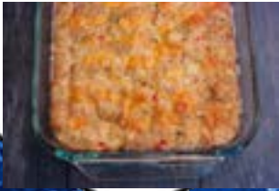
BROCCOLI & PARMESAN HASH BROWN